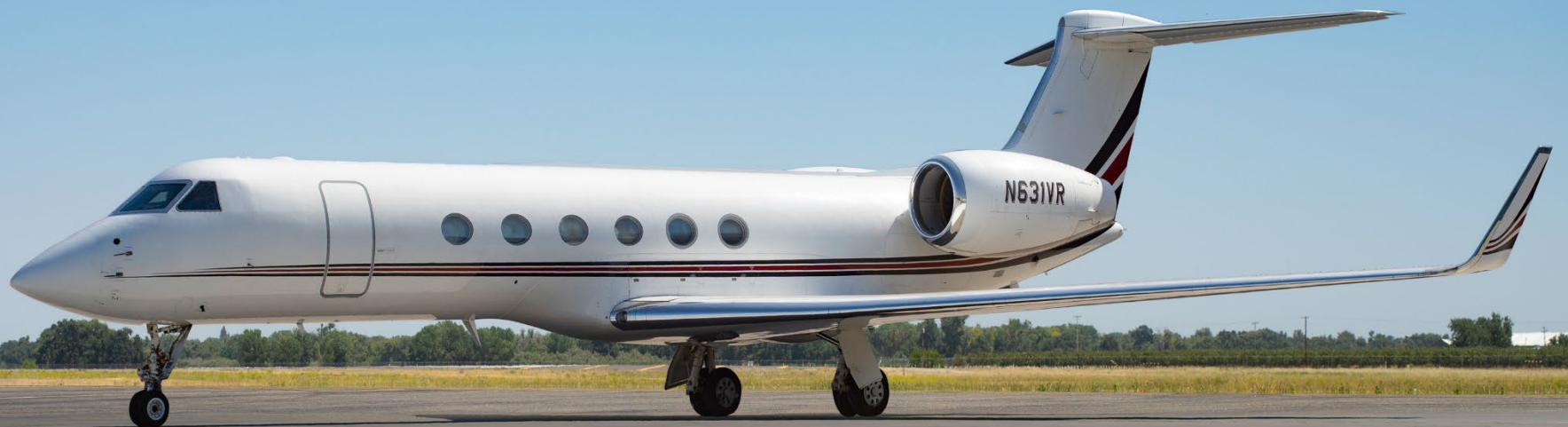
2001 Gulfstream GV S/N 631 N631VR